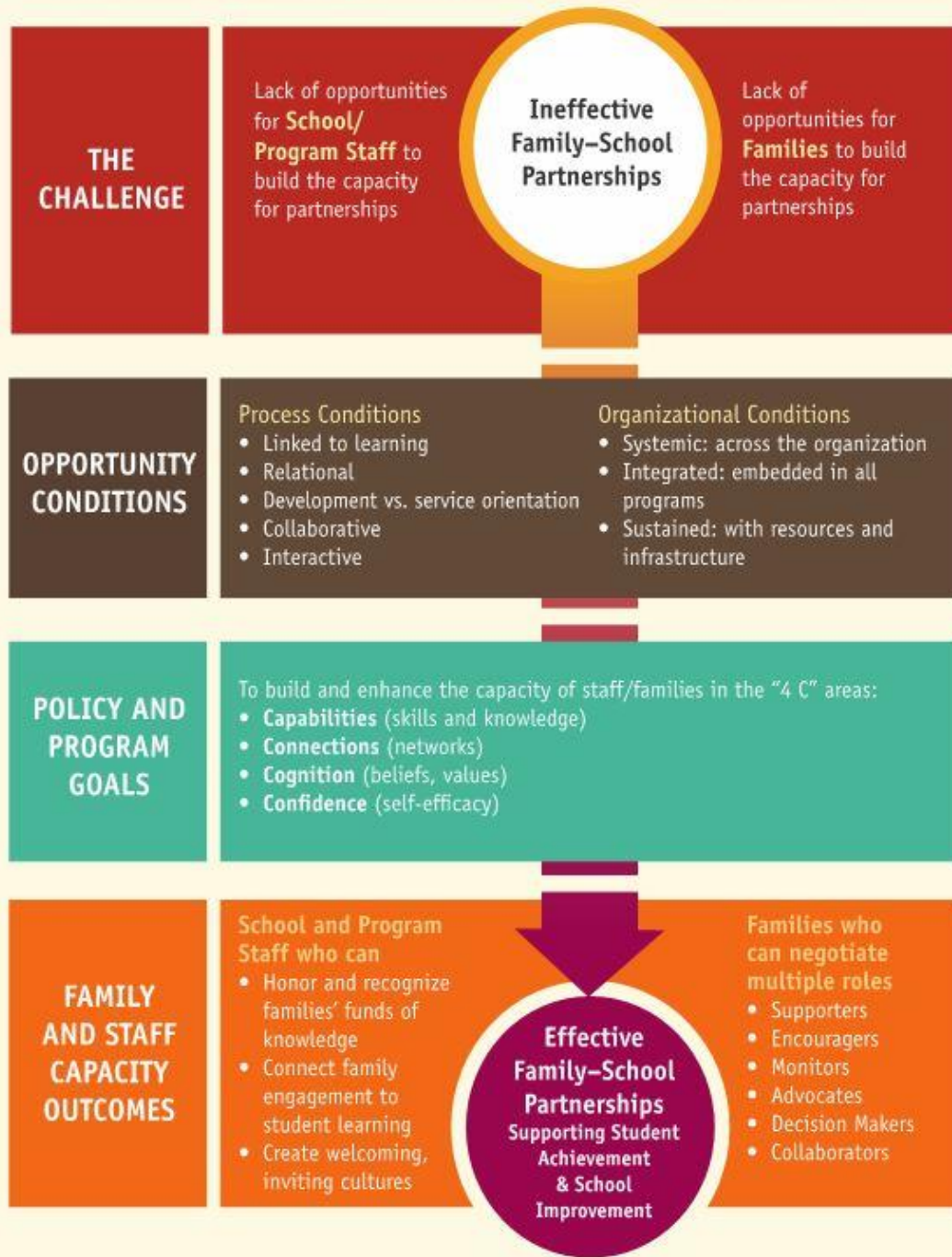
Figure 2: The Dual Capacity-Building Framework for Family-School Partnerships