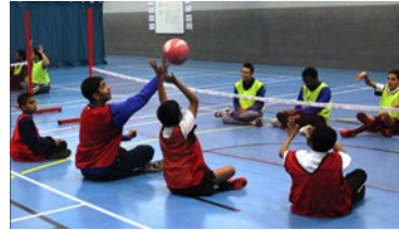
Slow the pace down