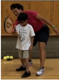
Hand under hand