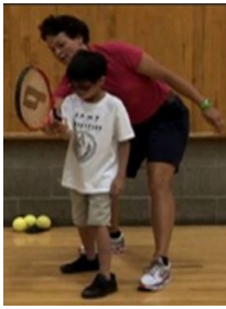
Hand under hand