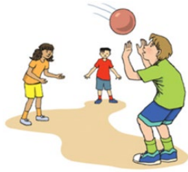
One person toss, other supports