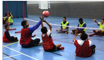
Slow the pace down