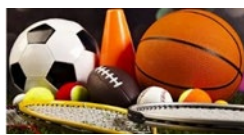
Help within equipment and activity ideas