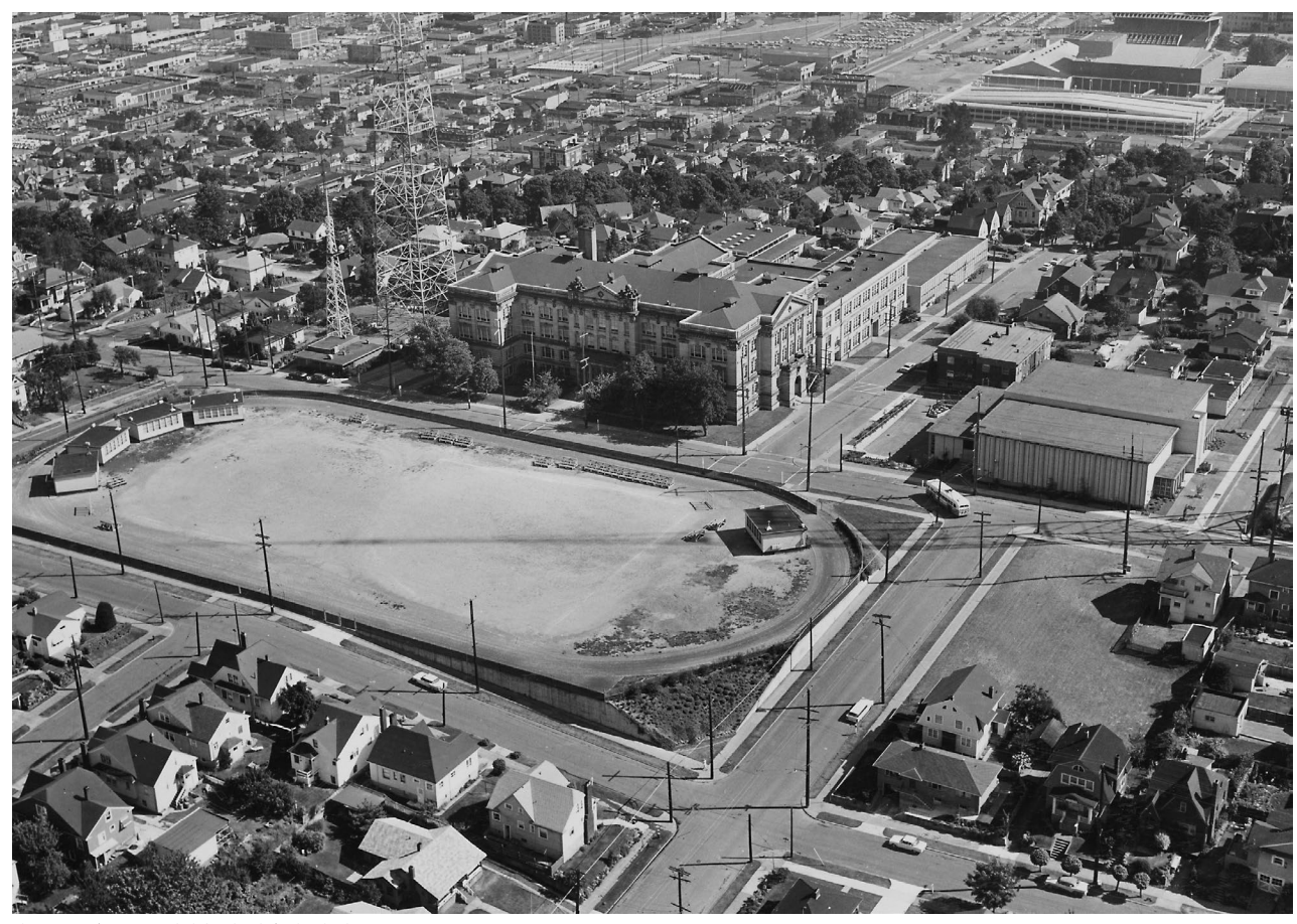
Queen Anne, 1963 SPSA 016-87

company, Lorig Associates, to lease the site and convert it for residential use while preserving its historic character. The conversion to apartments took place in 1987. More than 200,000 feet of classroom space was transformed into 139 apartments, several retained the tall windows and blackboards left over from the original school. The former boiler room was turned into a party room, and the 1929 auditorium-gymnasium, in the center of the structure, was demolished to create a circular driveway and entrance. The building was renamed The Queen Anne.