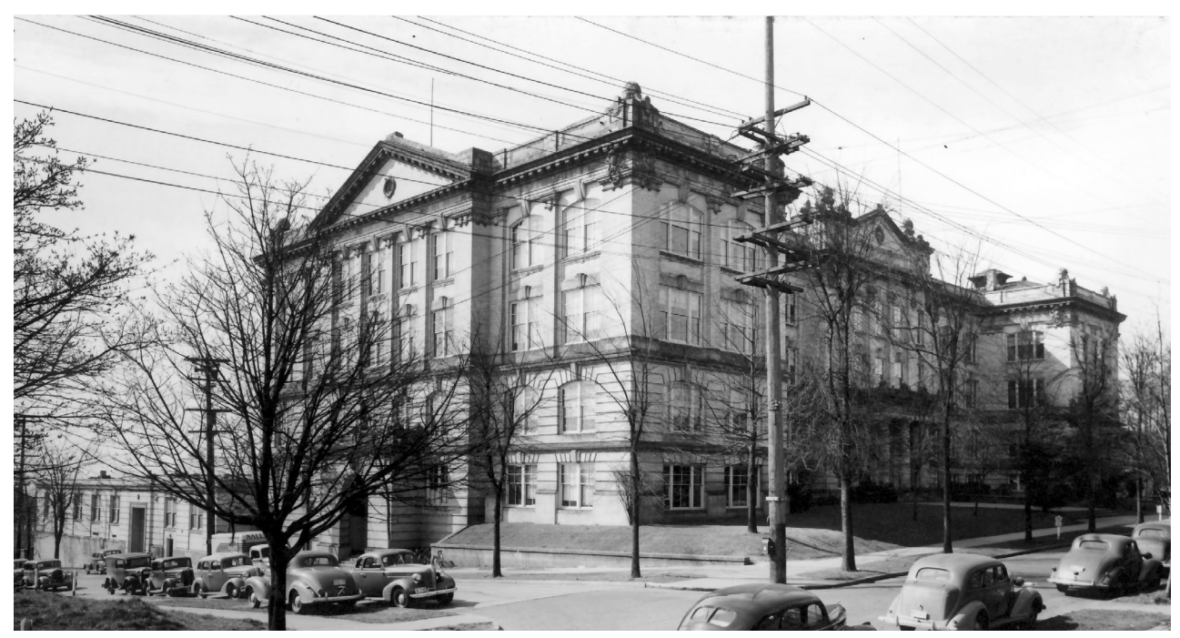
Queen Anne, 1940 SPSA 016-12

Seattle experienced rapid population growth during the years following the Alaska Gold Rush. Between 1902 and 1910, Seattle's total high school enrollment leaped from approximately 700 to around 4,500 students. Several new elementary schools were constructed atop Queen Anne Hill, and it was evident that a new high school would be needed to accommodate these students as they moved on to 9th grade.