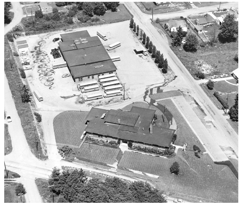
Goodhue, 1955

Nellie Goodhue School was closed in June 1961, in line with the Seattle School District's policy of integrating special education students into other classes when possible. Goodhue pupils were sent to Northgate and Oak Lake schools, and the building returned to its original use as an administrative center for the north end, housing a guidance center with school psychologists and social workers. The Student Assessment/Appeals Office moved from Goodhue to Wilson in summer 2000. In 2006, the district sold the 3.23-acre tract to a developer, and the property was rezoned for single-family residential.