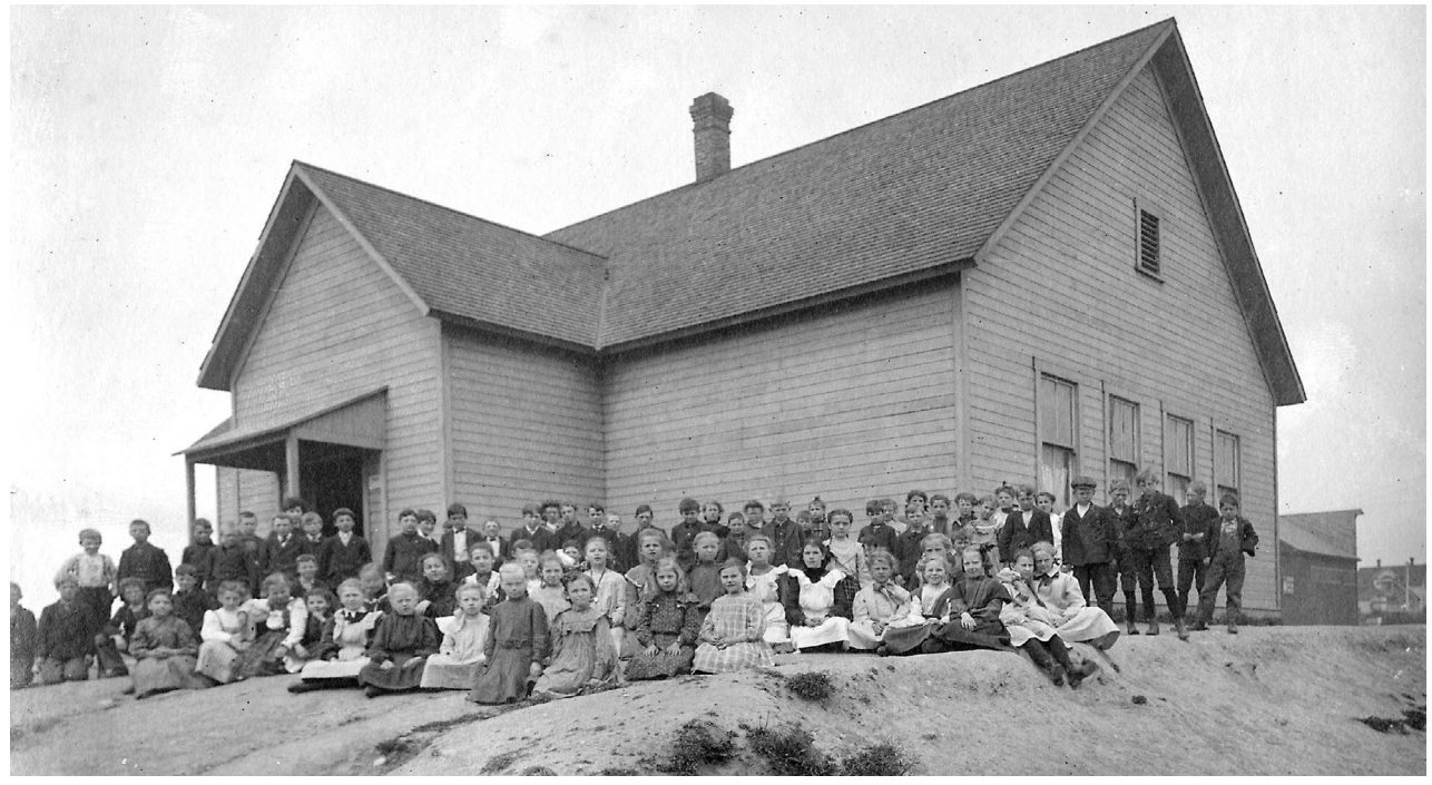
Broadway, ca. 1901 SPSA 201-40

In 1889 the community of Ballard was so small that the new school at its west end was simply called the Ballard School. Around 1901, the name was changed to Broadway School as Ballard School District No. 50 by then had a second school (Central School—see Ballard). At some point before September 1907, the Broadway School building was enlarged to four classrooms. When Ballard became part of the City of Seattle and Broadway Street was renamed Market Street to avoid confusion with the other Broadway on Capitol Hill, some people began to refer to Broadway School as the Market Street School.