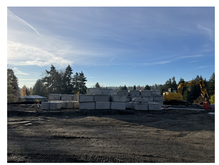
Ultra block units prepped for retaining wall install