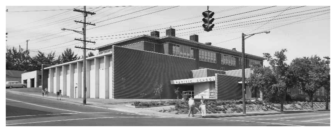
Pacific, 1958 SPSA 343-11

learned cooking, baking, sewing, and nursing skills, while boys studied carpentry, metalwork, automotive repair, and care of livestock and poultry. Most of them graduated into jobs for which they were already trained. Some studens went on to graduate from Garfield High School. In 1950, over 300 pupils and 20 teachers were housed in Pacific, and one-third of the population was non-white.