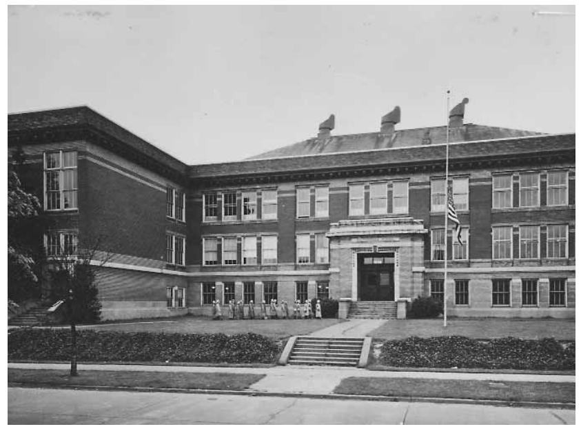
McDonald, ca. 1925 SPSA 247-33

McDonald was once again called into service as a school building in fall 1998 when students in the TOPS alternative program moved in while awaiting the renovation of their home at Seward. Stevens students moved into McDonald in fall 1999 during the reconstruction of their school building. Stevens will be reopened in September 2001. McDonald will continue to be used as an interim site for the forseeable future.