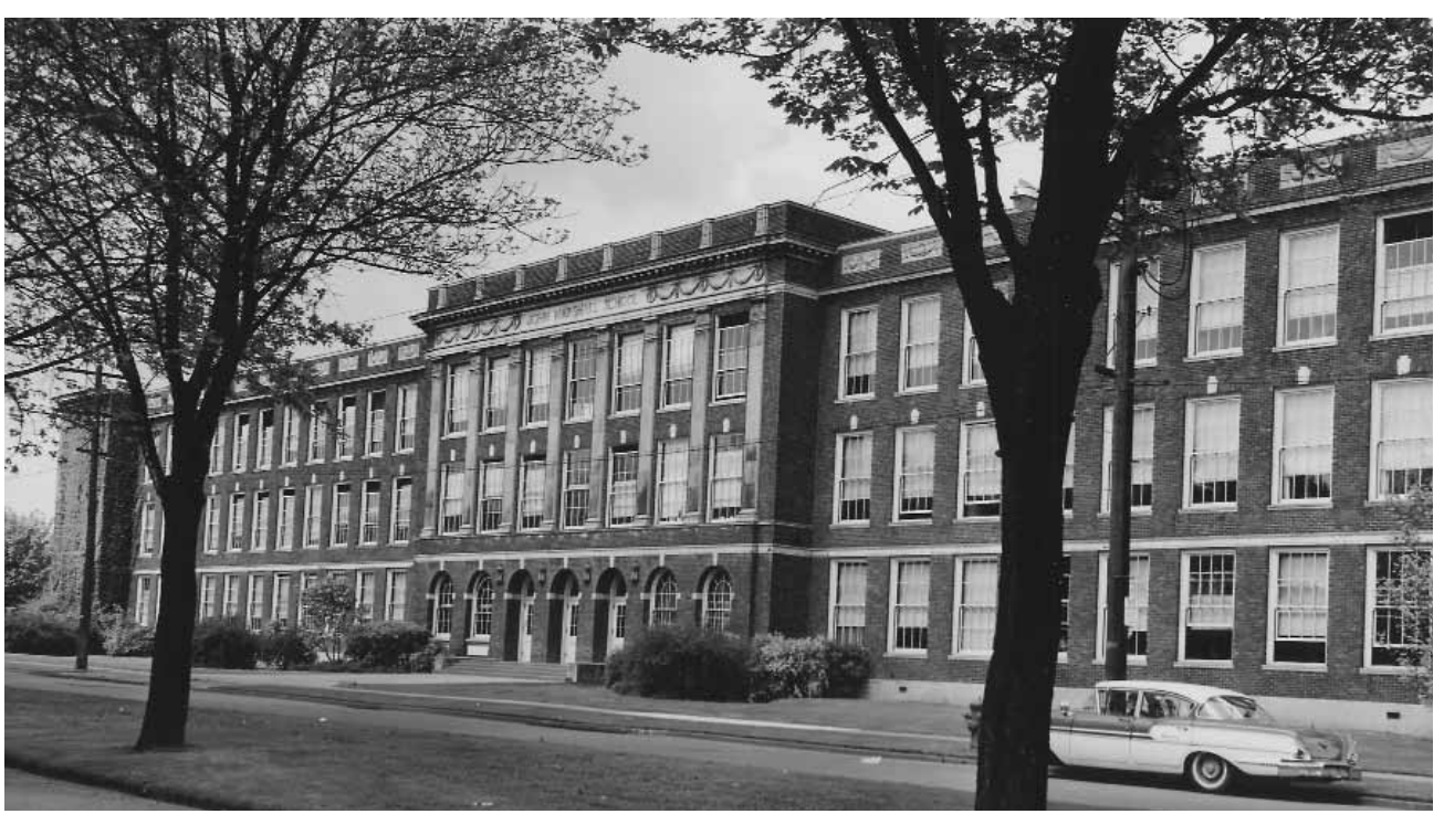
John Marshall, 1961 SPSA 108-17

In September 1982, a reentry program was added at Marshall for students suspended from regular high schools. In May 1983, the district proposed moving reentry programs from Addams and Holly Park Housing Project to Marshall to form a single program. The district also located a program for pregnant girls there because over 100 north end girls had dropped out of school, rather than go all the way to a similar program at Sharples in south Seattle. Marshall "gives them a chance to re-evaluate, learn from their mistakes, acquire survival skills and to start