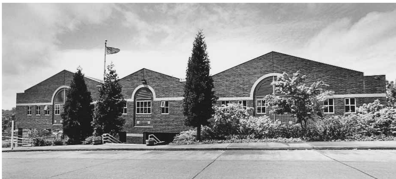
Hawthorne, 2000 SPSA 233-312

The area east of the Rainier Valley was first known as Southeast Seattle but wasn't annexed into the city until 1907. Hawthorne School opened in 1909 as an annex to the Columbia City School. The school was named for the famous American novelist Nathaniel Hawthorne. Designed according to the new "model school" plan, the building was constructed so two wings could be added when needed. The original structure did not have a lunchroom, auditorium, or gymnasium.