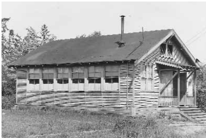
Lakewood, ca. 1922 SPSA 233-58

1909: Named on February 18; opened as an annex to Columbia City 1913: Became independent school 1915: Site expanded to 1.9 acres 1951: Site expanded to 2.6 acres 1978: Closed in June 1981: Demolished