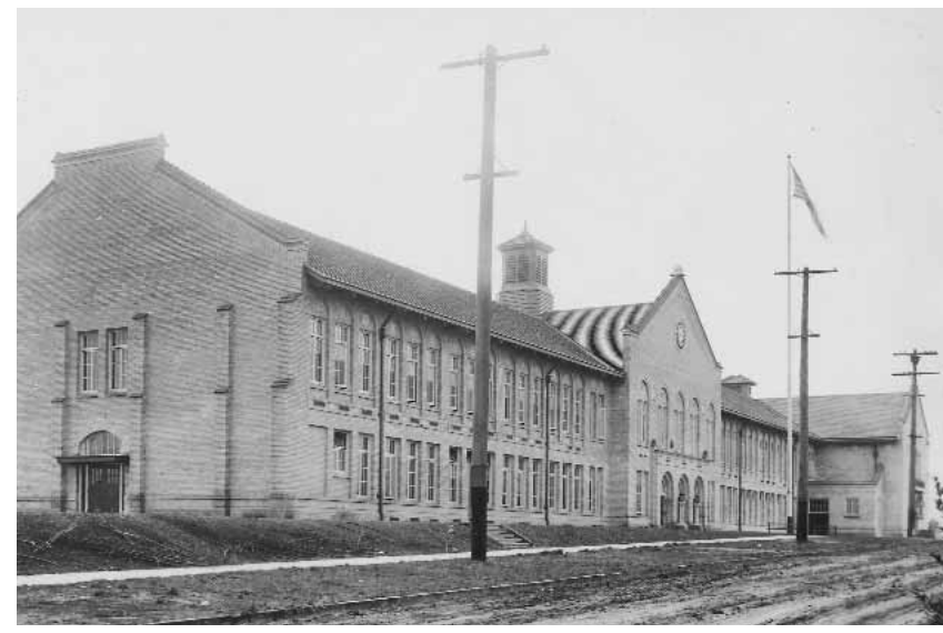
West Seattle ca 1917 SPSA 019-5

World War I brought an influx of workers to West Seattle's booming shipyards and steel mills. Enrollment at the high school increased dramatically and showed no signs of stopping. By 1923–24, more than 1,200 students attended West Seattle High School. Several portable classrooms were in use, including a temporary gymnasium.