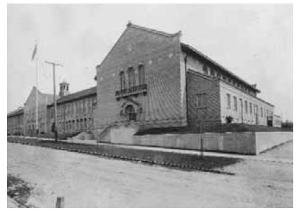
West Seattle, ca. 1917 SPSA 019-23