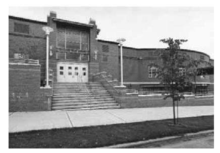
Ballard, 2000 @Mary Randlett SPSA 011-61

Configuration: 9–12 Colors: Red and black Newspaper: The Talisman Yearbook: The Shingle