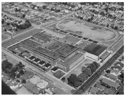
Ballard, 1963 SPSA 011-31

1997: Addition (Theo Damm) 1997: Closed and demolished