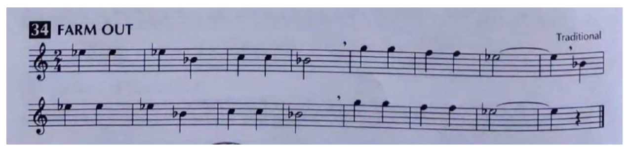
Standard of Excellence, Book 1 Flute, by Bruce Pearson, c. 2006 Neil A. Kjos. Page 10.

Now we are going to try putting G into a song! Let's play Farm Out (see below). Can you find the G notes in the song? Remember to check your posture and your hand positioning before starting. Now take a deep breath and play #34 Farm Out.