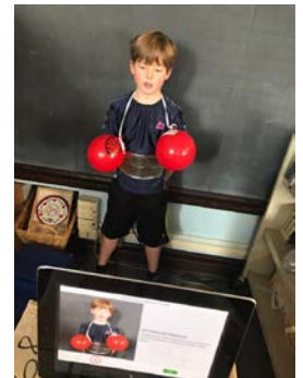
A student at Daniel Bagley Elementary sharing his research about a historical figure in Flipgrid, an online bulletin

Portable technology allows us to turn any space into a learning space, which expands the opportunities that we can provide and puts students at the center of their learning. Imagine our physical scientists using carbon dioxide sensors that hook up to portable devices to measure the amount of pH in the soil around our courtyard, and then clustering in small groups in the break-out spaces lining our commons to create digital models. Imagine our musicians recording themselves in practice rooms, posting recordings to a threaded discussion, and receiving immediate feedback on technique from peers and instructors, or our social scientists holding a mock election in the cafeteria. We are committed to providing all students with cross-disciplinary, hands-on, project-based learning experiences that challenge the way technology has traditionally been used in education. Desktops physically limit the experiences we can offer students and tether us to traditional models of teaching, which have contributed to the achievement gap among students.