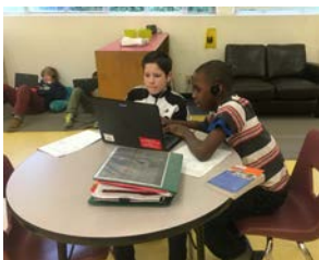
Students at Washington engaging in student-centered, personalized learning.

One of the traditional models that has served to widen this gap is the one-size-fits-all approach to instruction. Portable technology allows us to provide a more flexible, personalized learning experience for students. Students are able to access resources and tools, online or built into a learning management system, that support their individual needs and allow them to go further with their learning through reteaching, alternate modes of instruction, additional practice, immediate feedback, supports (i.e. read-aloud), and opportunities for extending learning. Students could absolutely access these resources and tools on a desktop, sitting alone, at the back of a classroom, facing a wall. However, portable technology has the power to transform the culture of a classroom and an entire school community.