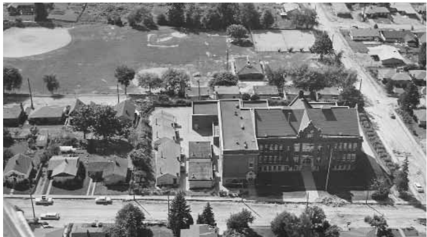
Emerson, 1963 SPSA 221.4

Beginning in the summer of 2000, a major renovation project was launched at Emerson. The historic 1909 building will be reconstructed and modernized. The 1930 addition will be demolished and replaced